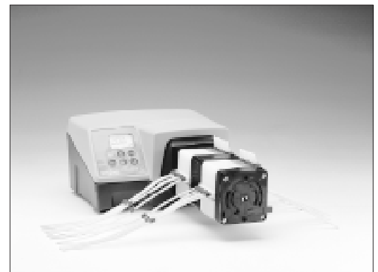
323U/MC8 + 318MCX